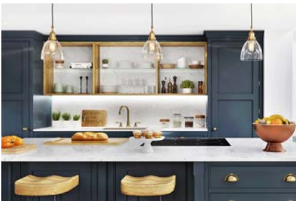
Full Kitchen Remodeling